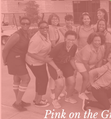
Pink on the Green Fundraiser